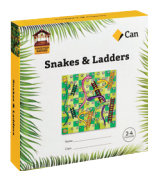
Snakes & Ladders Game