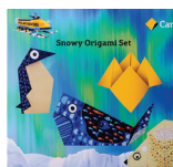
Snow Origami Set