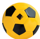
Mini Soccer Ball (size 2)