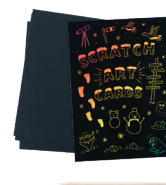
Scratch Art Cards