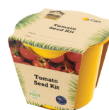
Tomato Seed Kit