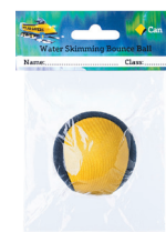
Water Skimming Bounce Ball