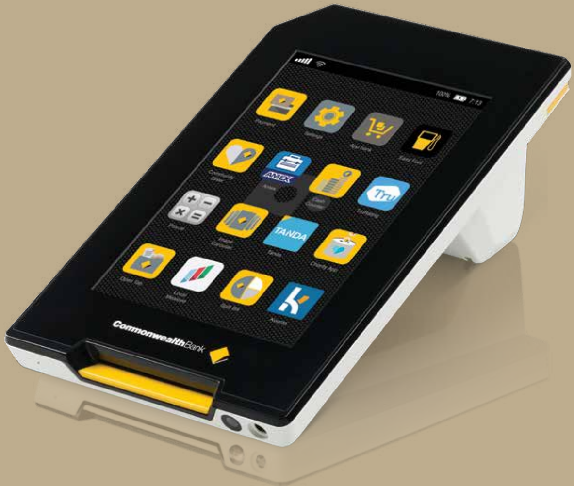
Image Carousel App User Guide.