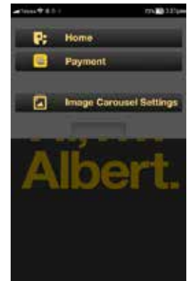
Image Carousel Settings