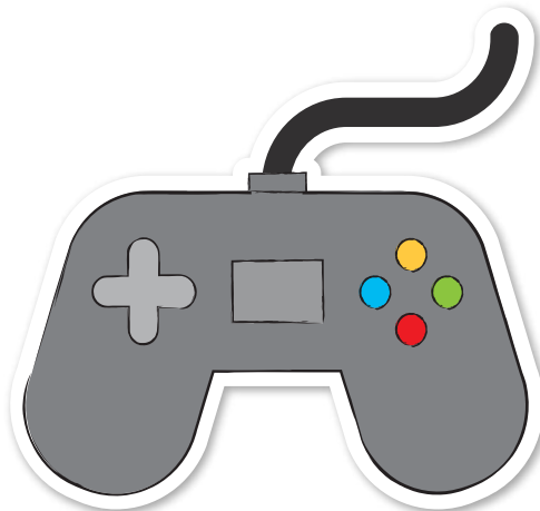
3. Computer game